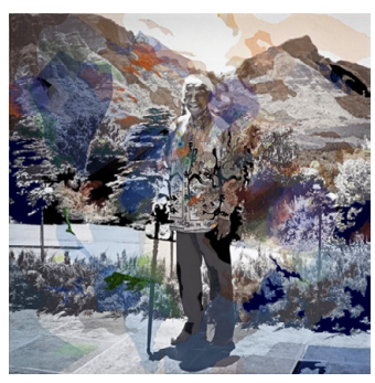
Mandela Landscape, Anton Corbijn en Berend Strik